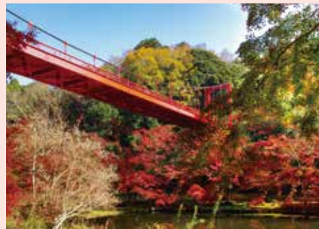
Izumi Nature Park