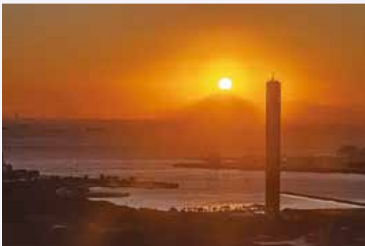
Mt. Fuji seen across the sea

"Diamond Fuji" is the name of the natural phenomenon in which the setting sun overlaps with Mt. Fuji, and the scene is as dazzling as a diamond. You can see Diamond Fuji in October and February from the longest artificial shoreline in Japan, located in Chiba City.