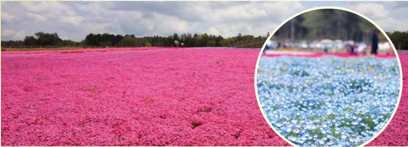
Moss pink at Tomita Satoniwa Park 711-1 Tomitacho, Wakaba-ku, Chiba City

During the spring at Tomita Satoniwa Park, 100,000 mats of moss pink blanket the entire flower field. Sunflowers grow in summer, and cosmos bloom in autumn, so you can enjoy the scenery of all four seasons.