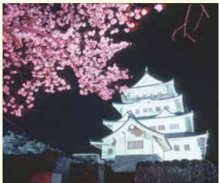
Chiba Castle and cherry blossoms